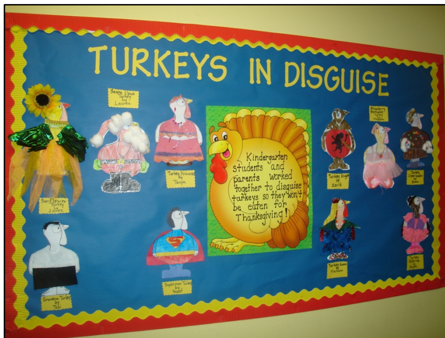
Display of Renée Glashow's class project.

http://www.free-clipart-pictures.net/holiday_clipart.html